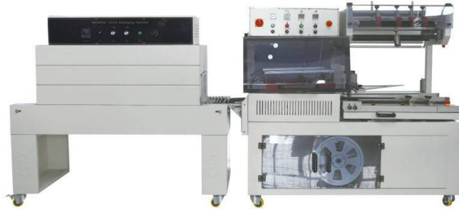
Automatic L sealer & Shrink tunnel

The machine can be added to an existing conveyor line or used by manually feeding the box/package onto the conveyor. Center fold POF/PVC film is used to automatically dispense, wrap and seal over your desired product.. The operator manually sets the sealing length for the product to be wrapped. The sealer has a safety system which immediately stops the sealing mechanism in the event the operators hand or object interferes with the sealing operation. The sealing mechanism has a non stick coating which results in a smoke free operation. All excess plastic is wound onto a dispenser below the machine which can easily be dispensed of. Once the product is sealed it then automatically runs through the thermal shrink tunnel where the the shrink film is heat shrunk tightly around product.