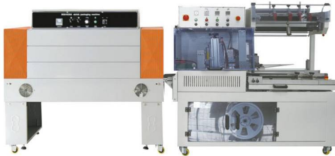
Automatic Side Sealer & Shrink tunnel